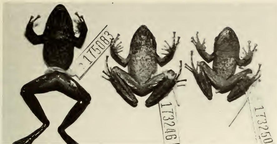
Fig. 4. Venters of Eleutherodactylus rhabdolaemus . Intensity of throat patterns declines to right. Paratype of E. rhabdolaemus , KU 175083; female paratype of E. pharangobates , KU 173246; and male paratype of E. pharangobates , KU 173250.

examined. The same general throat patterns are repeated in several of the Bolivian specimens except that a streaked throat is obvious in several males as well.